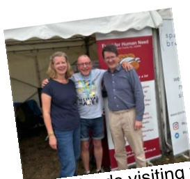
Special friends visiting the stall at Greenbelt 25

If you would like to read the full report please go to our website ( https://fundforhumanneed.org.uk/?page_id=38 ) or that of the charity commission (Charity Number 208866)