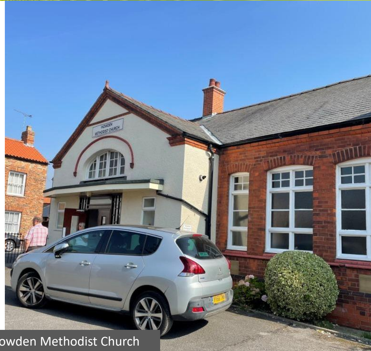
Howden Methodist Church

Identify all areas where energy is wasted