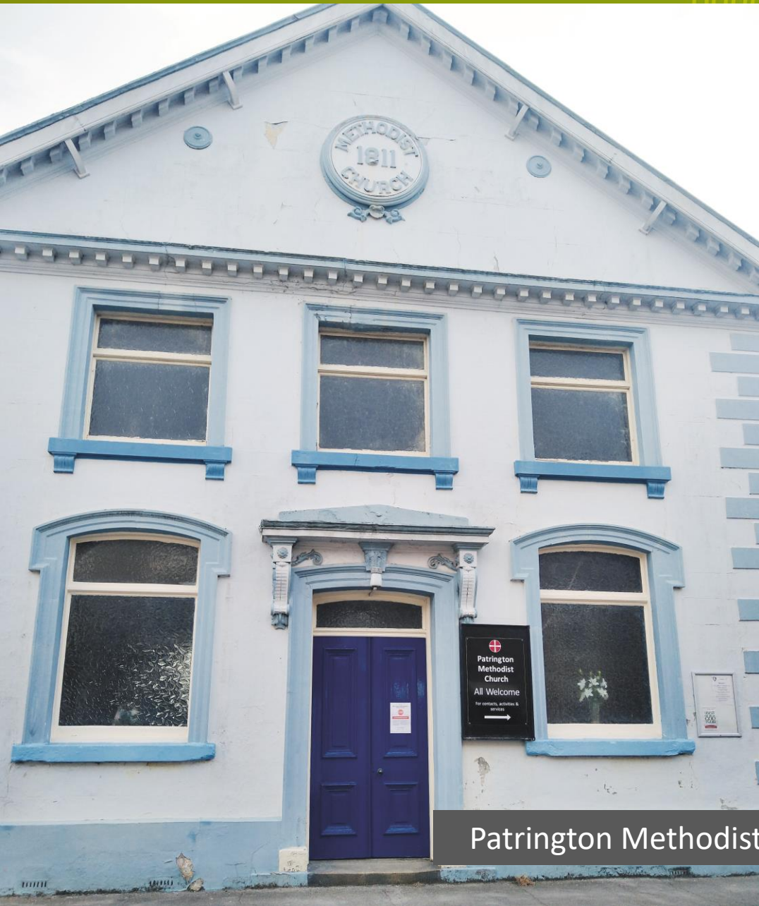
Patrington Methodist Church