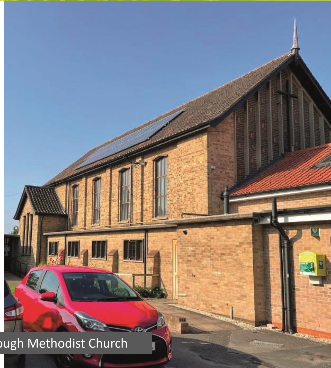
Brough Methodist Church

Identify all the systems that use energy within your church