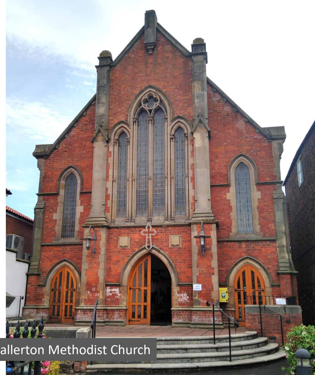
Northallerton Methodist Church

Consider alternative forms of low carbon heating to reduce carbon emissions