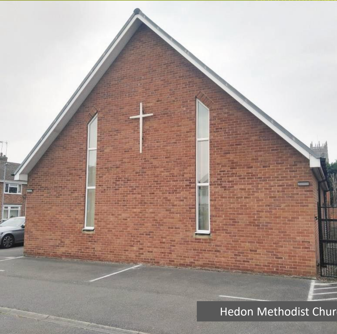
Hedon Methodist Church

STEP 6 Consider ways to generate your own renewable electricity and store it