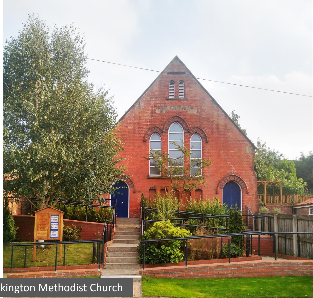
Walkington Methodist Church

Calculate the estimated capital costs, plus future energy use with costs and carbon footprint